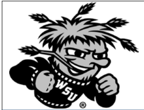
No. 12/12 Wichita State (6-0, 0-0 MVC) SHOCKERS

Website: www.BYUcougars.com Facebook: /BYUbasketball | /BYUcougars Twitter: @BYUbasketball | @BYUcougars Instagram: BYUcougars Vine: BYUcougars Hashtag: #BYUhoops Blog: byucougars.com/blog/m-basketball