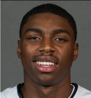
BATON ROUGE, LOUISIANA FUTURE COLLEGE PREP