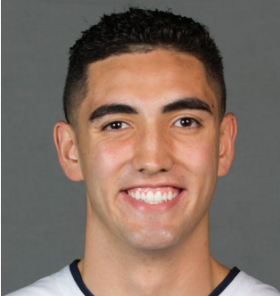
PROVO, UTAH TIMPVVIEW HS