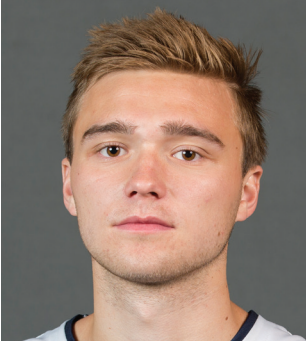
GILBERT, ARIZONA HIGHLAND HS