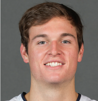
MEQUON, WISCONSIN HOMESTEAD HS