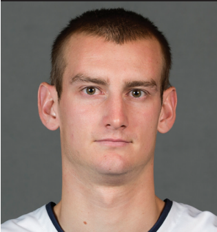
HIGHLAND, UTAH UTAH