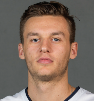
PROVO, UTAH PROVO HS