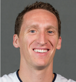
OREM, UTAH SALT LAKE CC