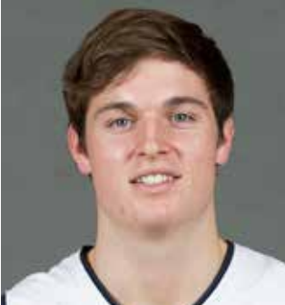
MEQUON, WIS. HOMESTEAD HS