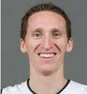
OREM, UTAH SALT LAKE CC