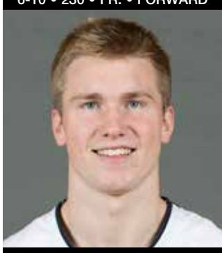
ALPINE, UTAH LONE PEAK HS