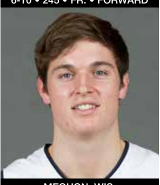
MEQUON, WIS. HOMESTEAD HS