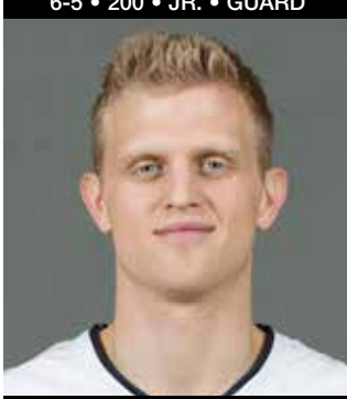
ALPINE, UTAH LONE PEAK HS