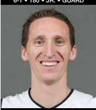
OREM, UTAH SALT LAKE CC