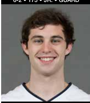
ARCADIA, ARIZONA BLOOMINGTON SOUTH HS