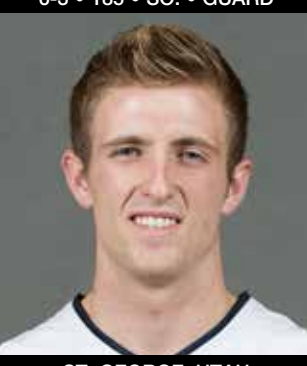
ST. GEORGE, UTAH SNOW CANYON HS