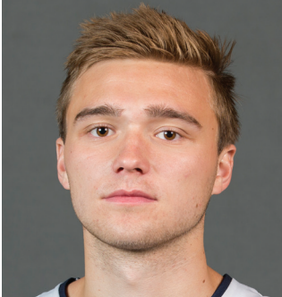
GILBERT, ARIZONA HIGHLAND HS