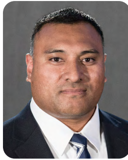
KALANI SITAKE Head Coach BYU, 2000