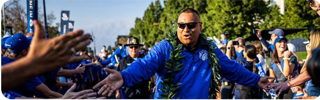
Kalani Sitake (pronounced kah-lah-nee see-tah-kay) enters his eighth season overseeing the BYU football program in 2023.

In his 23rd overall season as a coach, Sitake leads the program he once played for under legendary Hall of Fame coach LaVell Edwards. A former Cougar running back (1994, 1997-2000), Sitake is the 14th head coach in BYU history and just the fourth since 1972, when Edwards took over the program. Sitake is the first former player under Edwards to be named head coach at BYU.