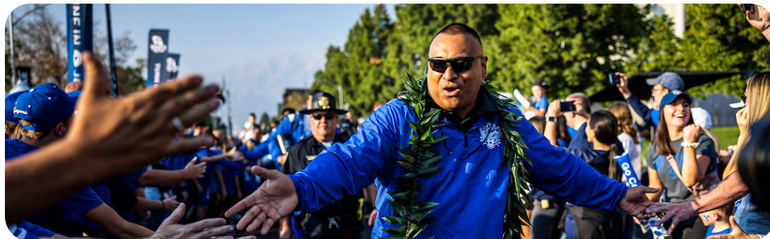
Kalani Sitake (pronounced kah-lah-nee see-tah-kay) is in his eighth season overseeing the BYU football program in 2023.

In his 23rd overall season as a coach, Sitake leads the program he once played for under legendary Hall of Fame coach LaVell Edwards. A former Cougar running back (1994, 1997-2000), Sitake is the 14th head coach in BYU history and just the fourth since 1972, when Edwards took over the program. Sitake is the first former player under Edwards to be named head coach at BYU.