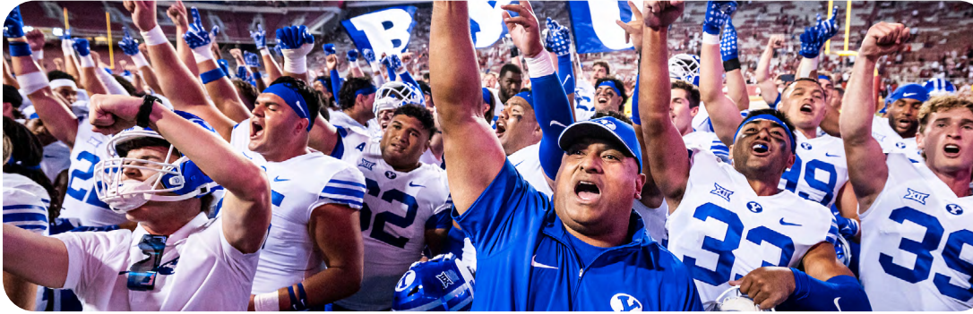
Kalani Sitake (kah-lah-nee see-tah-kay) enters his ninth season overseeing the BYU football program in 2024.

In his 24rd overall season as a coach, Sitake leads the program he once played for under legendary Hall of Fame coach LaVell Edwards. A former Cougar running back (1994, 1997-2000), Sitake is the 14th head coach in BYU history and just the fourth since 1972, when Edwards took over the program. Sitake is the first former player under Edwards to be named head coach at BYU.