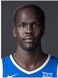
#0 Mawot Mag 6-7 | Forward | Senior Melbourne, Australia