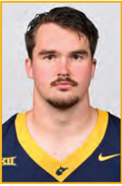
DT, 6-3, 282, r-Sr. French Finnish School of Helsinki Helsinki, Finland