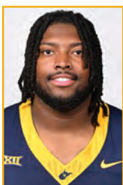
DL, 6-3, 312, r-Sr. Dublin Coffman Dublin, Ohio