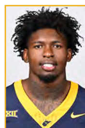
RB, 6-2, 225, r-Sr. Northern Iowa Palatka, Fla.