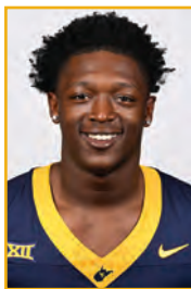
S, 5-9, 194, r-Sr. Akron Akron, Ohio