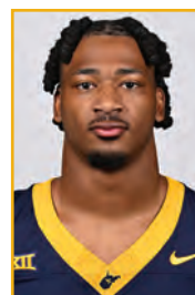
CB, 5-11, 166, r-Sr. South Alabama Kansas City, Mo.