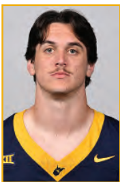
TE, 6-4, 223, Sr. Northern Illinois Rocklin, Calif.