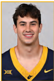
K, 6-1, 185, SO. Tulane Glen Ellyn, Ill.