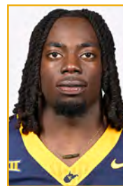
N/S, 5-11, 206, Sr. Jacksonville State Vienna, Ga.