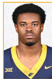
BAN, 6-4, 226, So. Cabell Midland Huntington, W.Va.