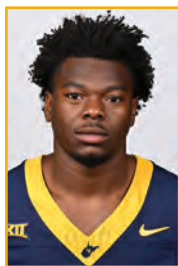
WR, 5-9, 165, Sr. Eastern Michigan Clewiston, Fla