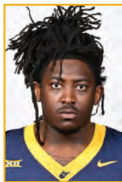
DL, 6-5, 288, Sr. Missouri Orlando, Fla.