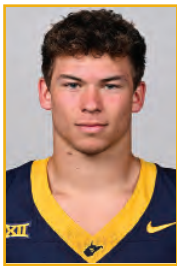
RB, 5-9, 194, So. IMG Academy Leesburg, Va.