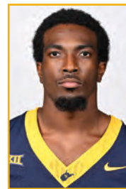
WR, 5-11, 185, r-Sr. S.C. State Port St. John, Fla.