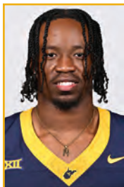
S, 6-0, 200, Sr. Jacksonville State Monrovia, Liberia