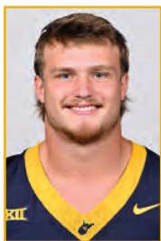
LB, 6-0, 226, Jr. East Lincoln Denver, N.C.