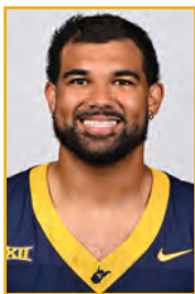
DL, 6-2, 265, r-Sr. Incarnate Word San Antonio, Texas