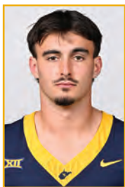
P, 6-2, 210, Sr. Mentone Grammar School Melbourne, Australia