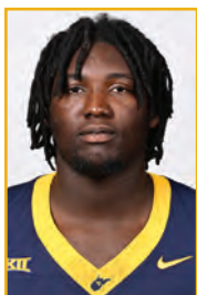
DL, 6-3, 296, r-Jr. Collins Hill Suwanee, Ga.