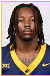
CB, 5-11, 189, Sr. Appalachian State Charlotte, N.C.