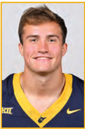
LB, 6-2, 230, r-Sr. Ohio State Ironton, Ohio