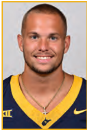
PR, 5-10, 192, r-Sr. Morgantown Morgantown, W.Va.