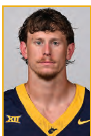
WR, 6-2, 211, r-Sr. Idaho State Salinas, Calif.