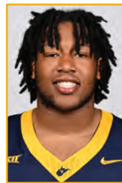
DL, 6-3, 295, So. Auburndale Auburndale, Fla.