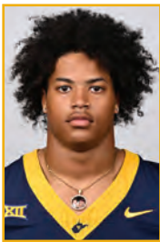
S, 5-11, 190, So. Douglas County Douglasville, Ga.