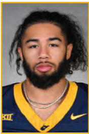
TE, 6-3, 235, Sr. Jacksonville State Martinsburg, W.Va.