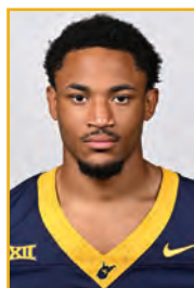
WR, 6-2, 185, r-Sr. Jacksonville State Villa Rica, Ga.