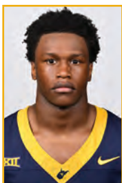
RB, 5-10, 191, So. Iowa Central CC Harrisburg, Pa.