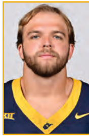
LB, 6-1, 230, r-Sr. Colorado State Arvada, Colo.