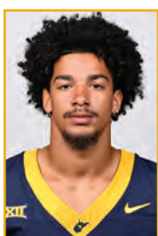
WR, 5-9, 162, r-Sr. Jacksonville State Martinsburg, W.Va.