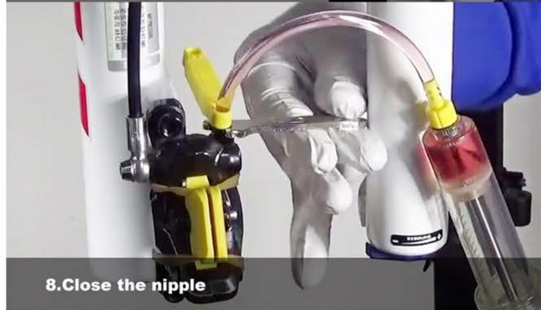
8.Close the nipple