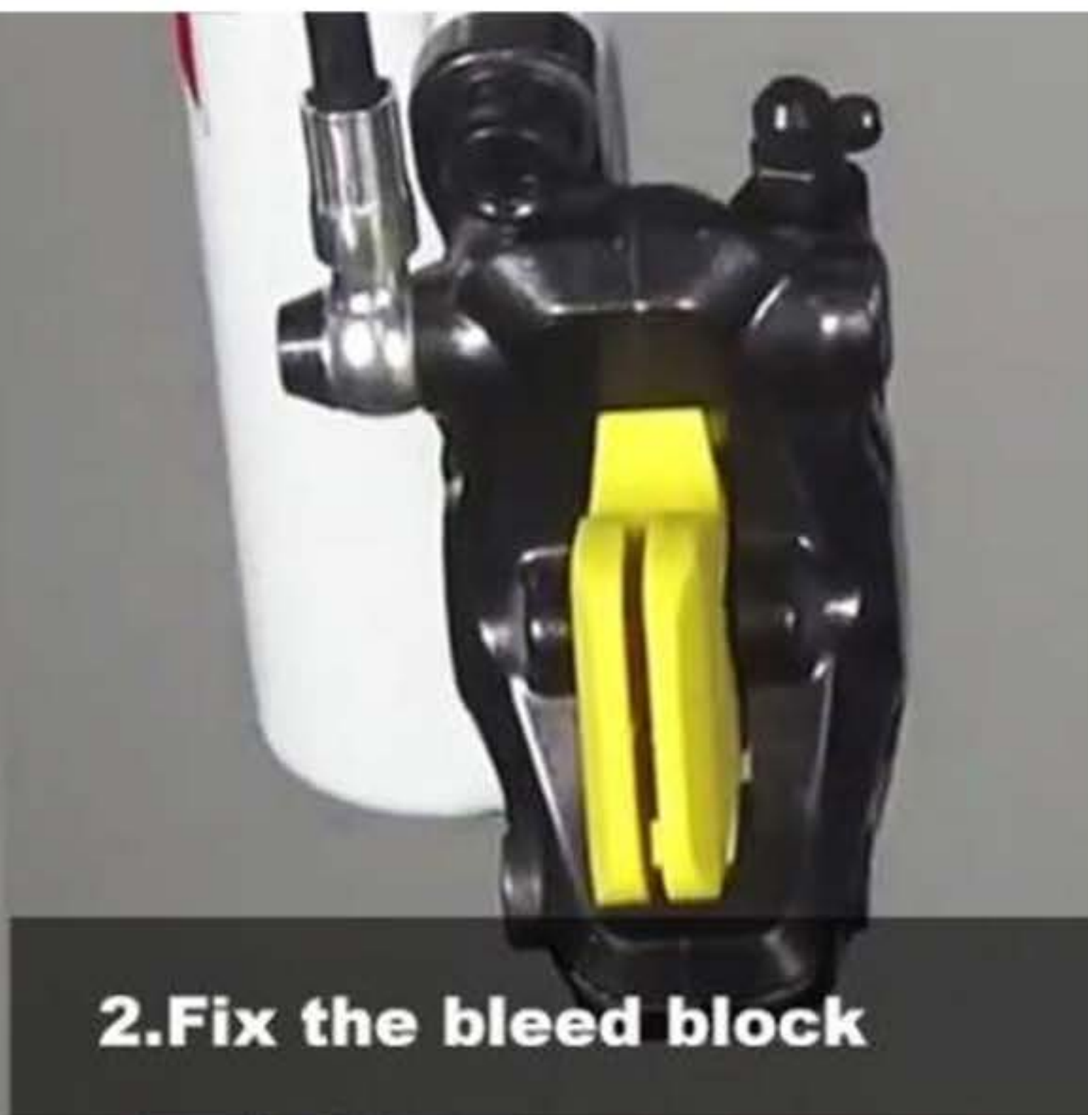
2.Fix the bleed block