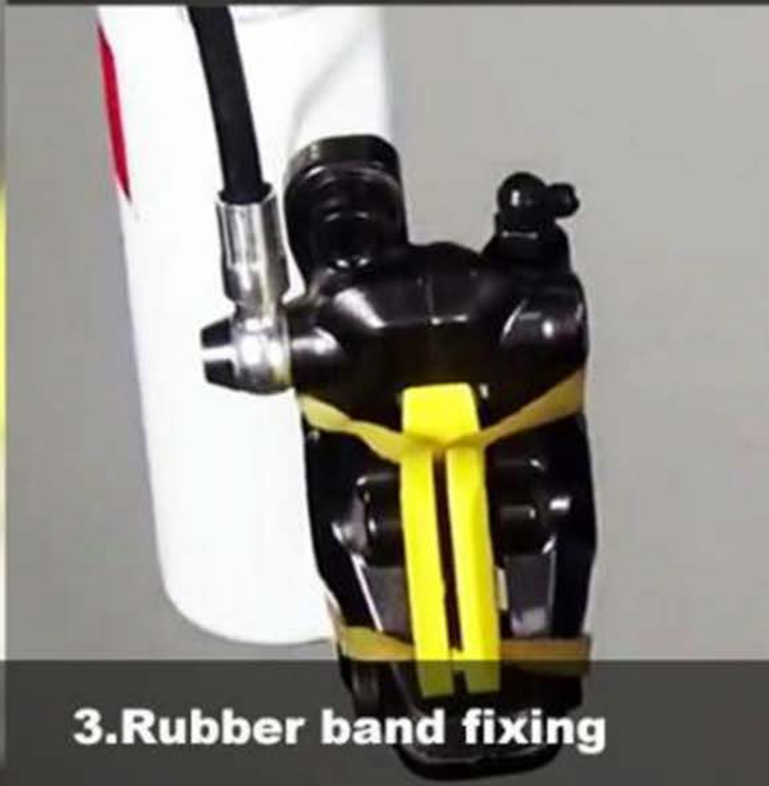
3.Rubber band fixing