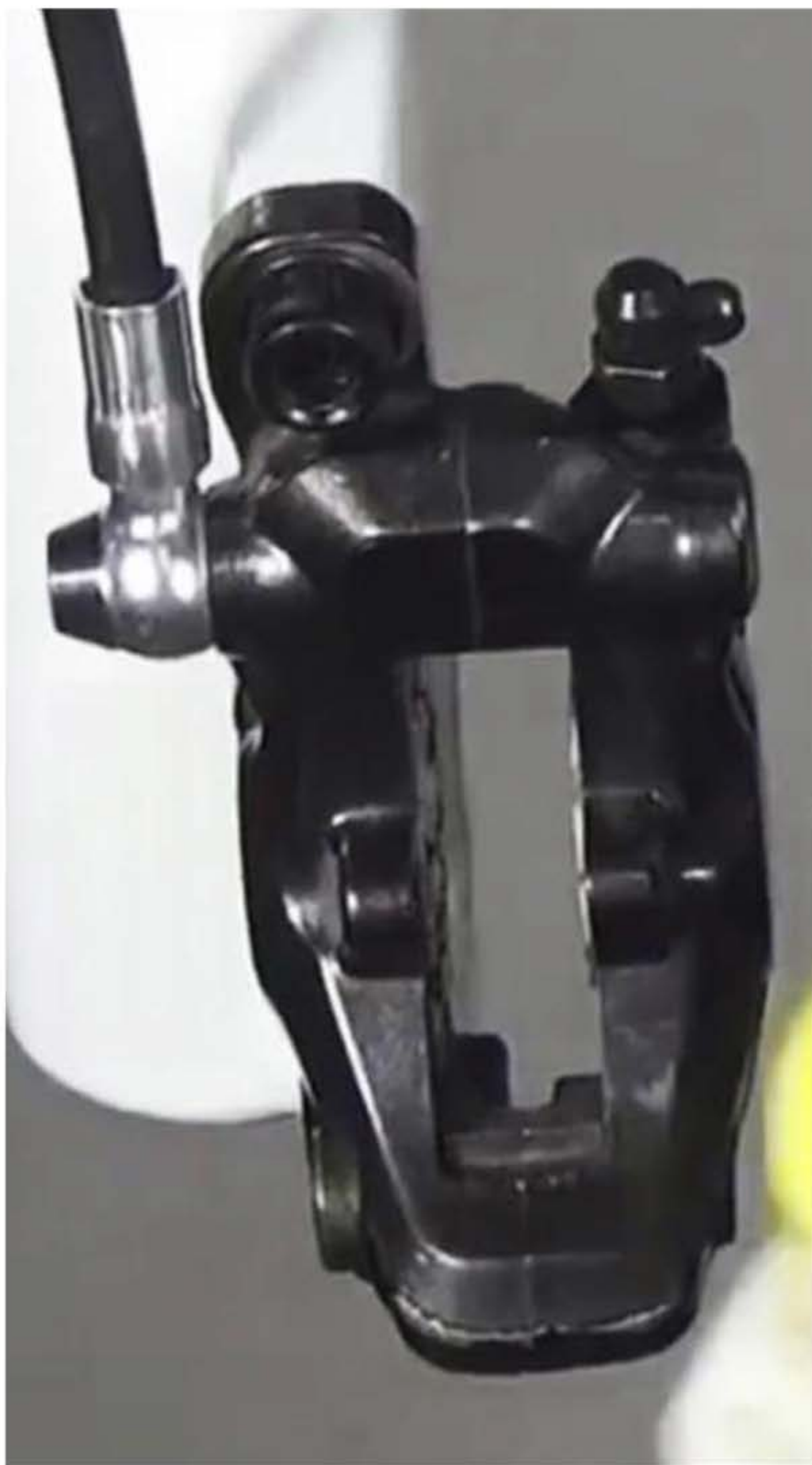
1.Remove the circlip