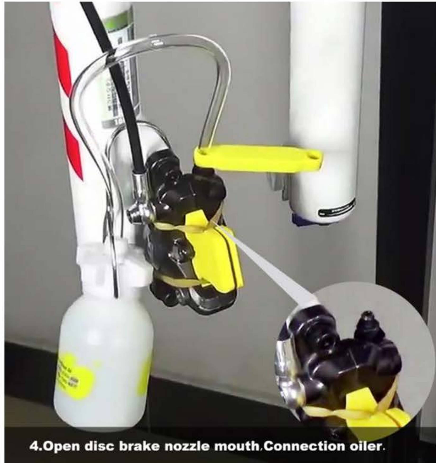
4. Open disc brake nozzle mouth. Connection oiler.