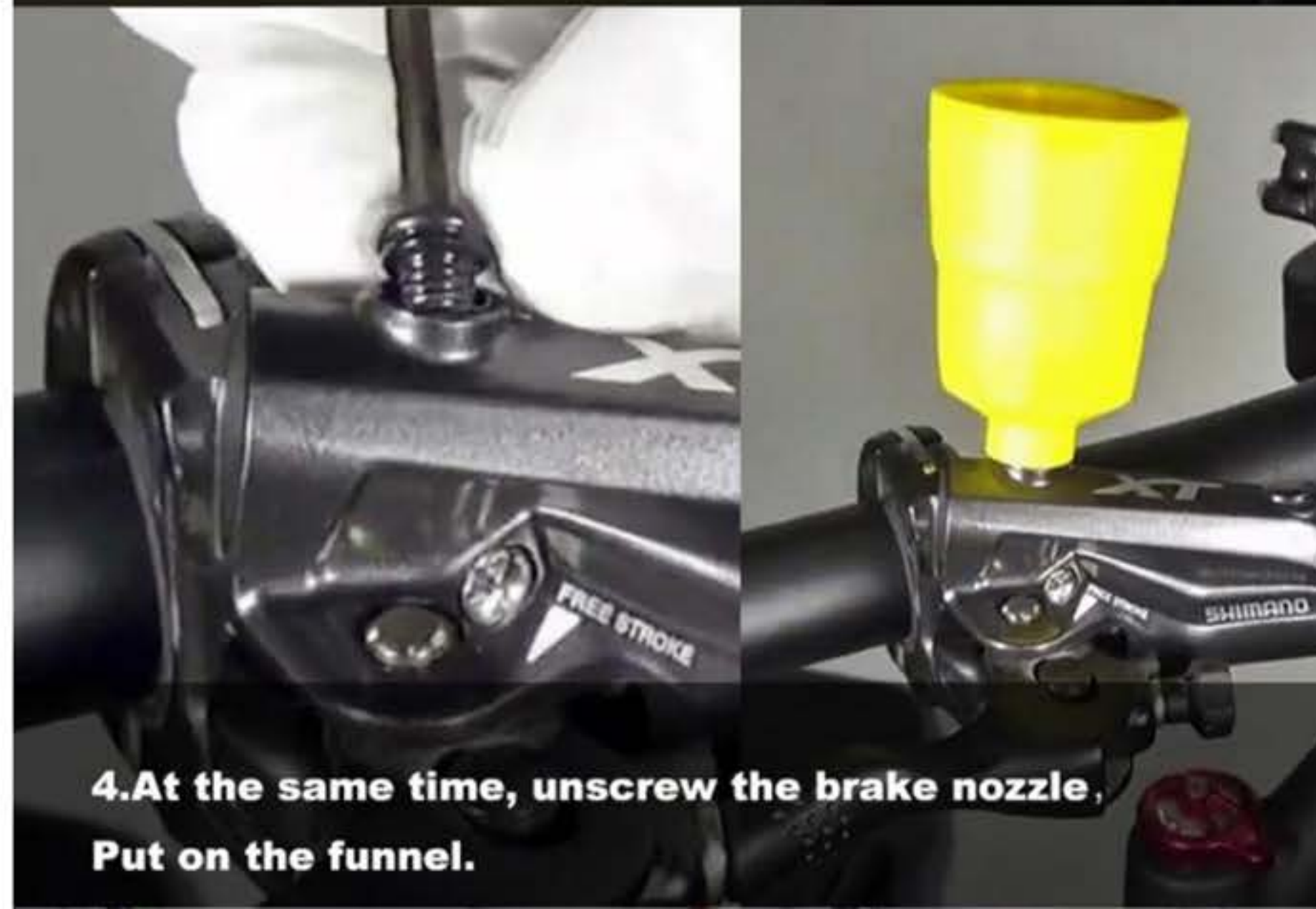
4. At the same time, unscrew the brake nozzle, Put on the funnel.