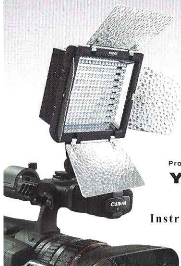
Pro LED Video Light YN 160