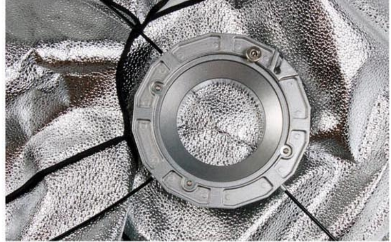
step 2 put the strip steel into the hole of ring