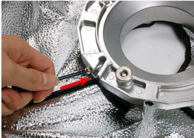
step 3 insert quick fix strip steel into hole of ring