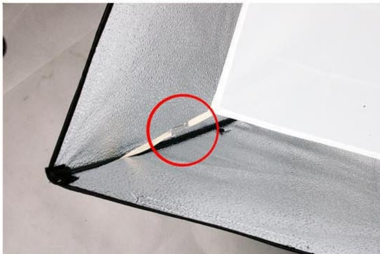
step 5 put inner soft cloth inside soft box