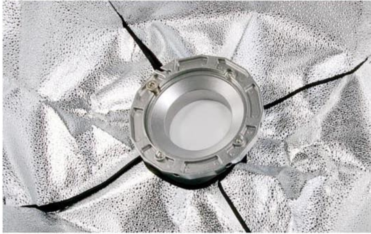
step 1 take out the soft box and ring