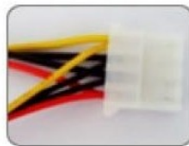
4Pin for HDD