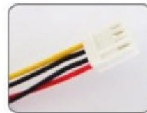
4Pin for FDD