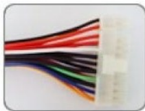
20+4P for M/B