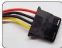
4Pin for HDD