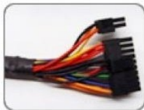
20+4P for M/B