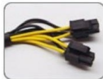
4+4pin +12V CPU