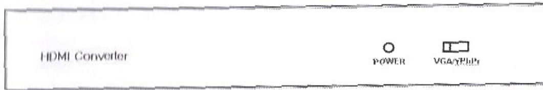
Physical Connection Showing Picture: