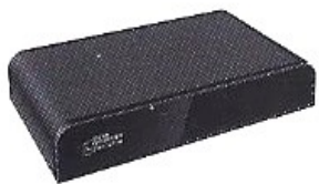
HDMI to SDI converter