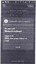
4. Enter Keyboard "9376", Press "Enter"