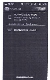
3. Turn on "Bluetooth", Search for devices