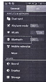
2. Click "Bluetooth"