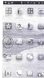
1. Click "Settings"