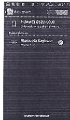
5. Connected successfully