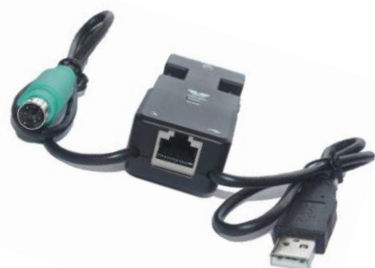
CAT5 KVM 8/16/32 Port