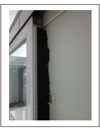
Dust-proof brush for entry door