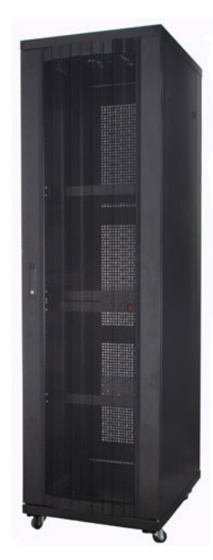
Perforated door (Door: 6-5)