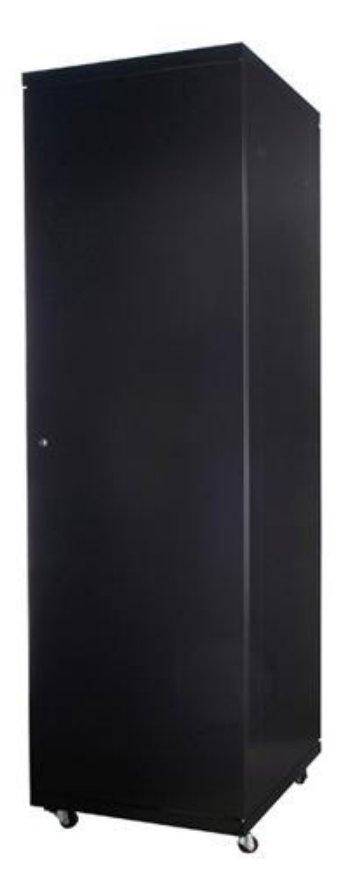
Plate solid door (Door: 7-1)