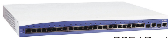
PSE / Router with POE