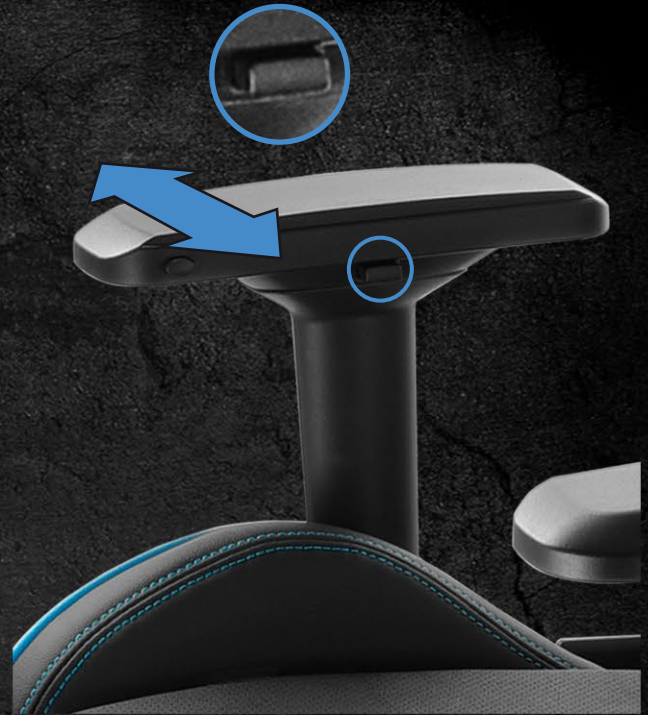
Individually adjustable in width