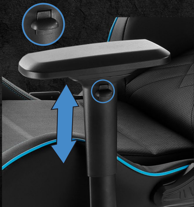
Flexible height adjustment