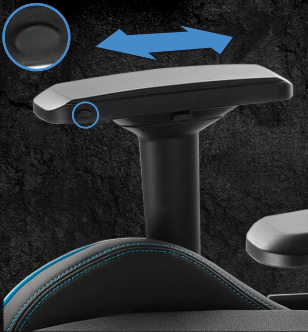
Customizable to every arm length