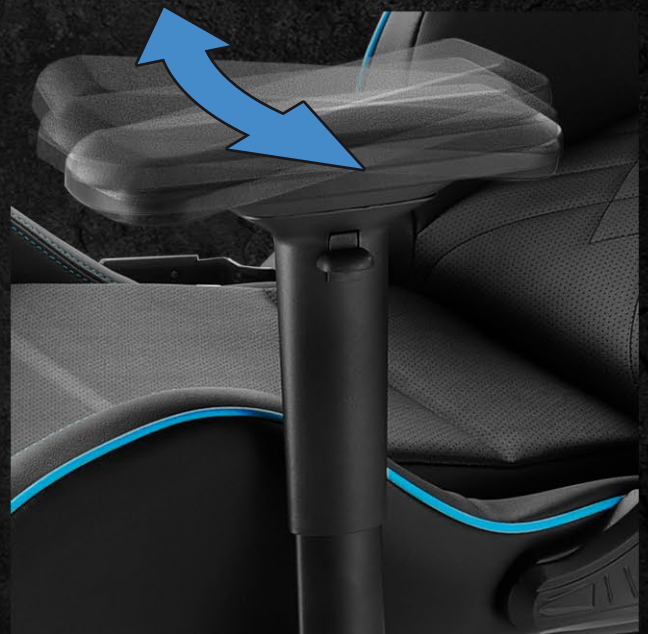
Easily adjust the angles