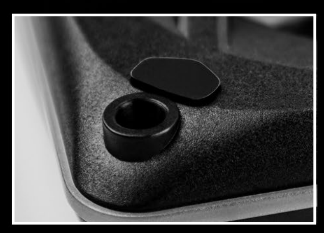
Rubberized contact points on the back of the fan frame reduce vibration onto the PC casing to ensure a quieter operation.