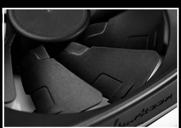
The RGB SHARK Lights are equipped with a newly developed type of aerodynamic blades and also possess a fluid dynamic bearing, all of which produces an air flow rate of 56 cubic meters per hour at 1,000 rpm and a quiet 15.2 dB(A).