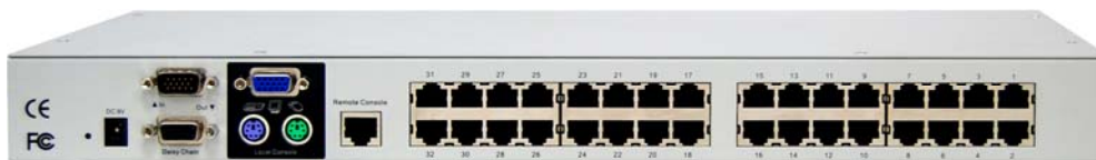
UKS-0132OSD - Rear View