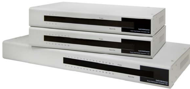
UKS CAT5 KVM Switch Family – UKS-0108OSD/UKS-0116OSD/UKS-0132OSD

The UKS series Cascadable CAT5 KVM Switch Family is a cost-effective implementation of the CAT5 KVM Switching Technology in enterprise scenario. The UKS Cascadable CAT5 KVM Switches are designed to fulfill the critical demands ever higher server capacity in modern data centers. The UKS Cascadable CAT5 KVM Switch Family features UKS-0132OSD, UKS-0116OSD and UKS-0108OSD, each of which can allow dual console access over any one server desktop among the 16 ports/32 ports over a single CAT5 KVM Switch main unit. With cascaded UKS units, the total managed port capacity can be maximized to 256 ports. The UKS series provides up to 100M of cabling distance.