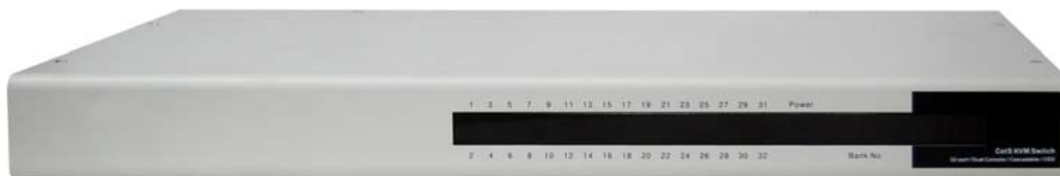
UKS-0132OSD - Front View