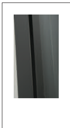
Front glass door