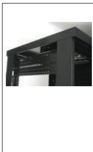
Widen mounting angle