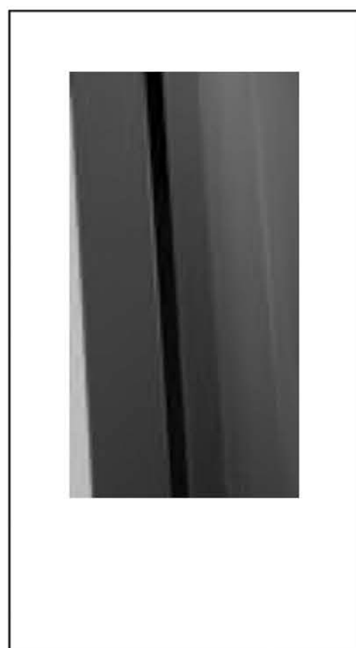
Front glass door