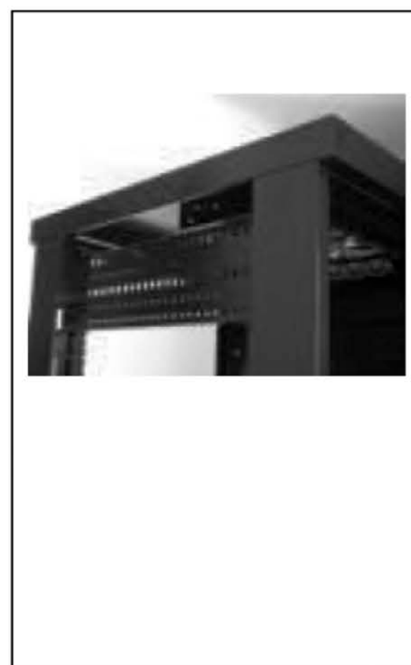
Widen mounting angle