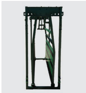
Adjustable Width - Narrows for working calves.