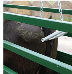
Adjustable Alley Stop