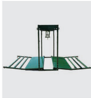
Drop-Down Sides for Emergency Exit