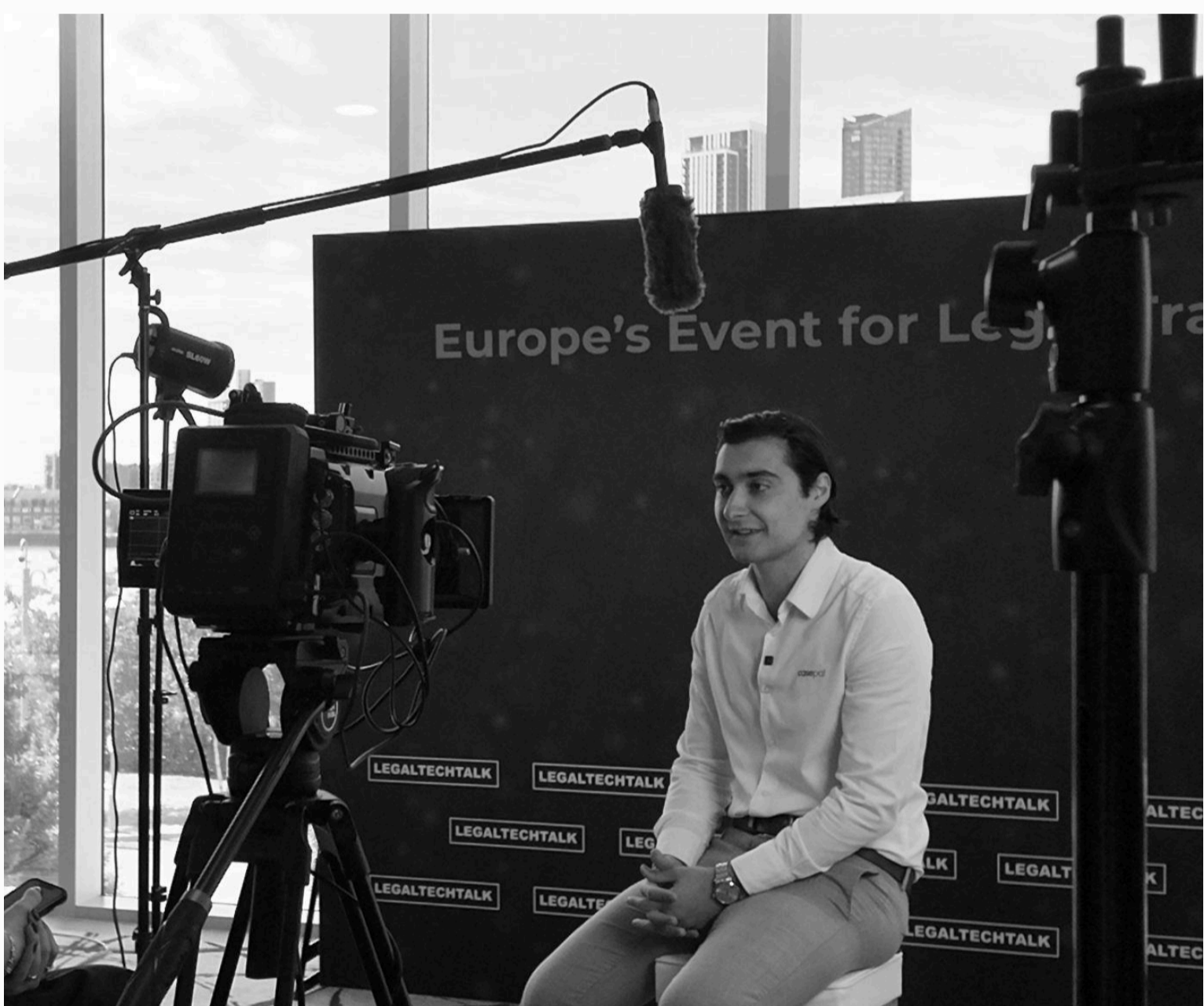
Interview in the LegalTech Talk, London, UK