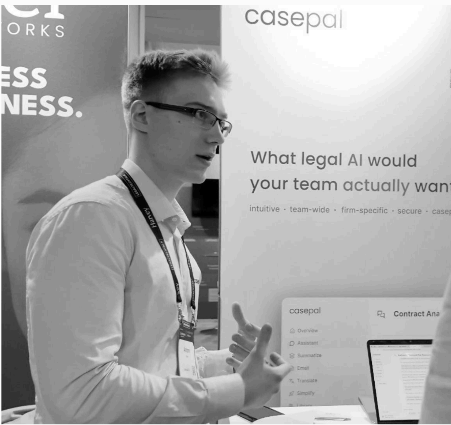
Featured at the LegalTechTalk 2025, London, UK