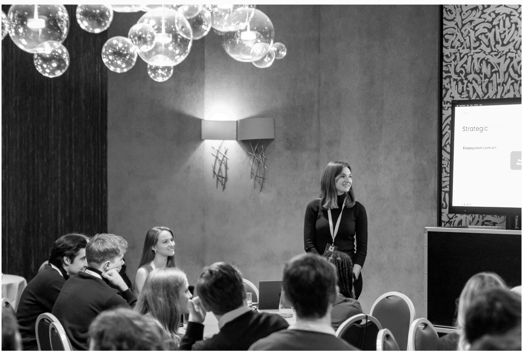
Featured with LegalDirect at JEE Winter Conference 2025 in Brussels, Belgium

Our team maintained active presence across New York , London , Austin , Vienna , Brussels , Athens , Nicosia , and Amsterdam , with new offices in Belgium reinforcing our European and US commitment.