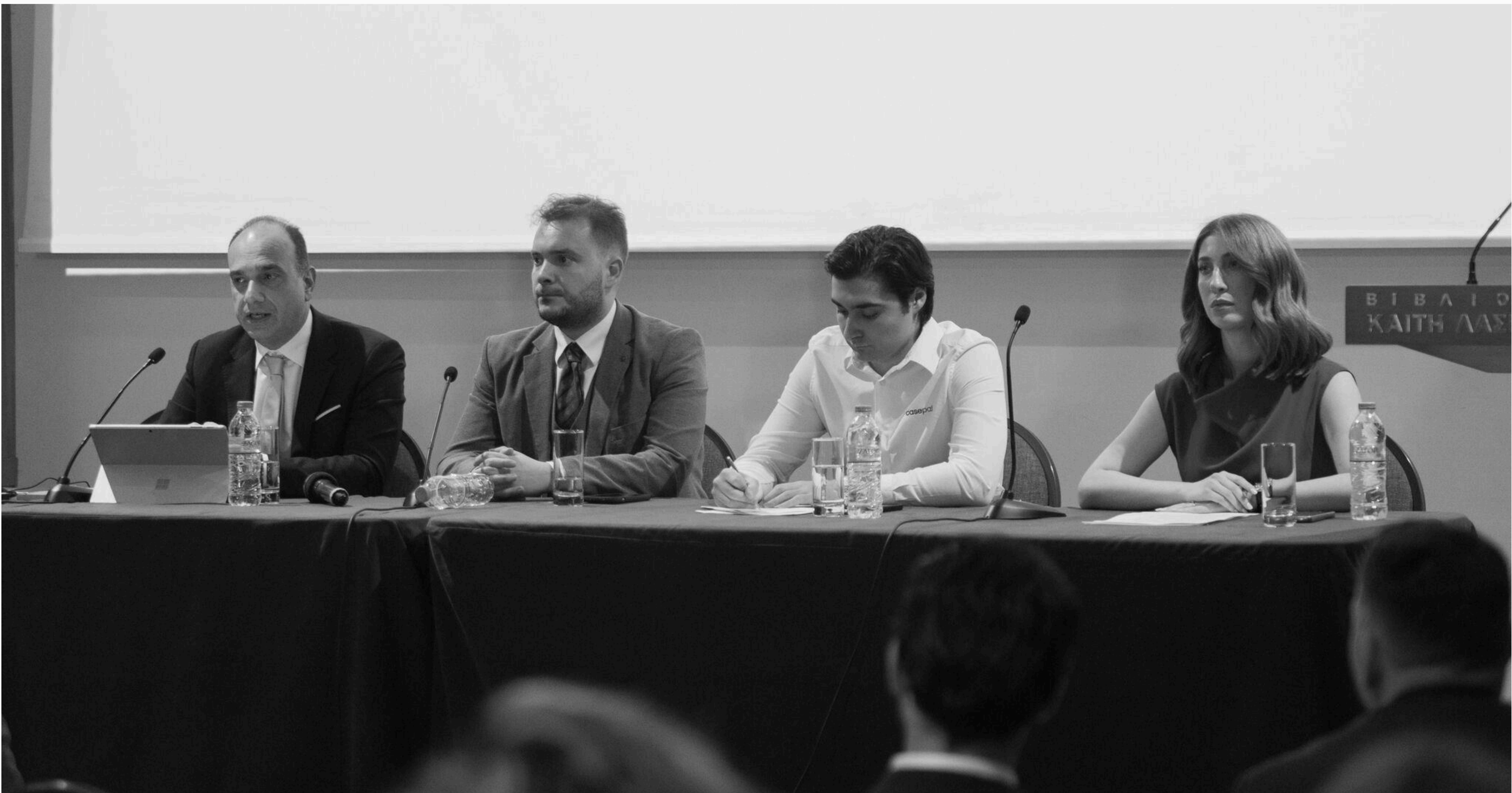
Panel discussion on the ethical promotion of legal AI in Athens

2025 brought casepal to the conversations shaping legal innovation: Legal Geek , LegalTechTalk , TLTF Summit , Gen AI Summit , Vis Moot and JEE Winter , and more.