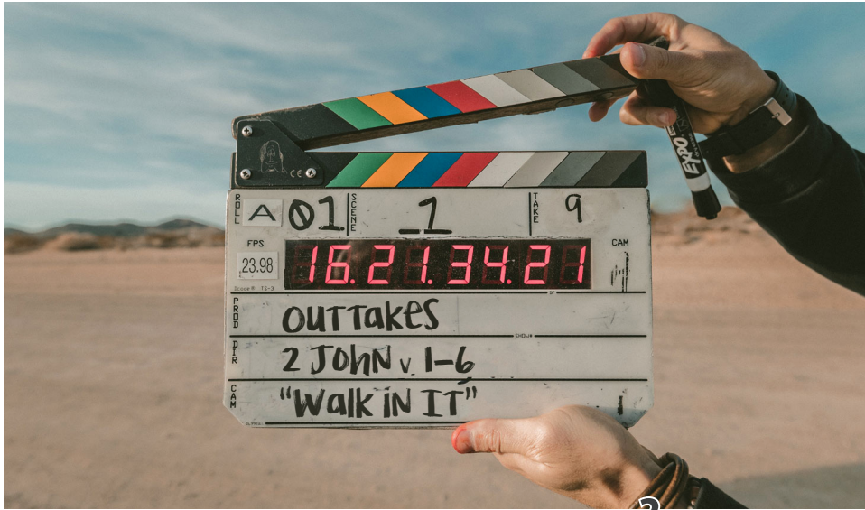
2 John 1:1-6