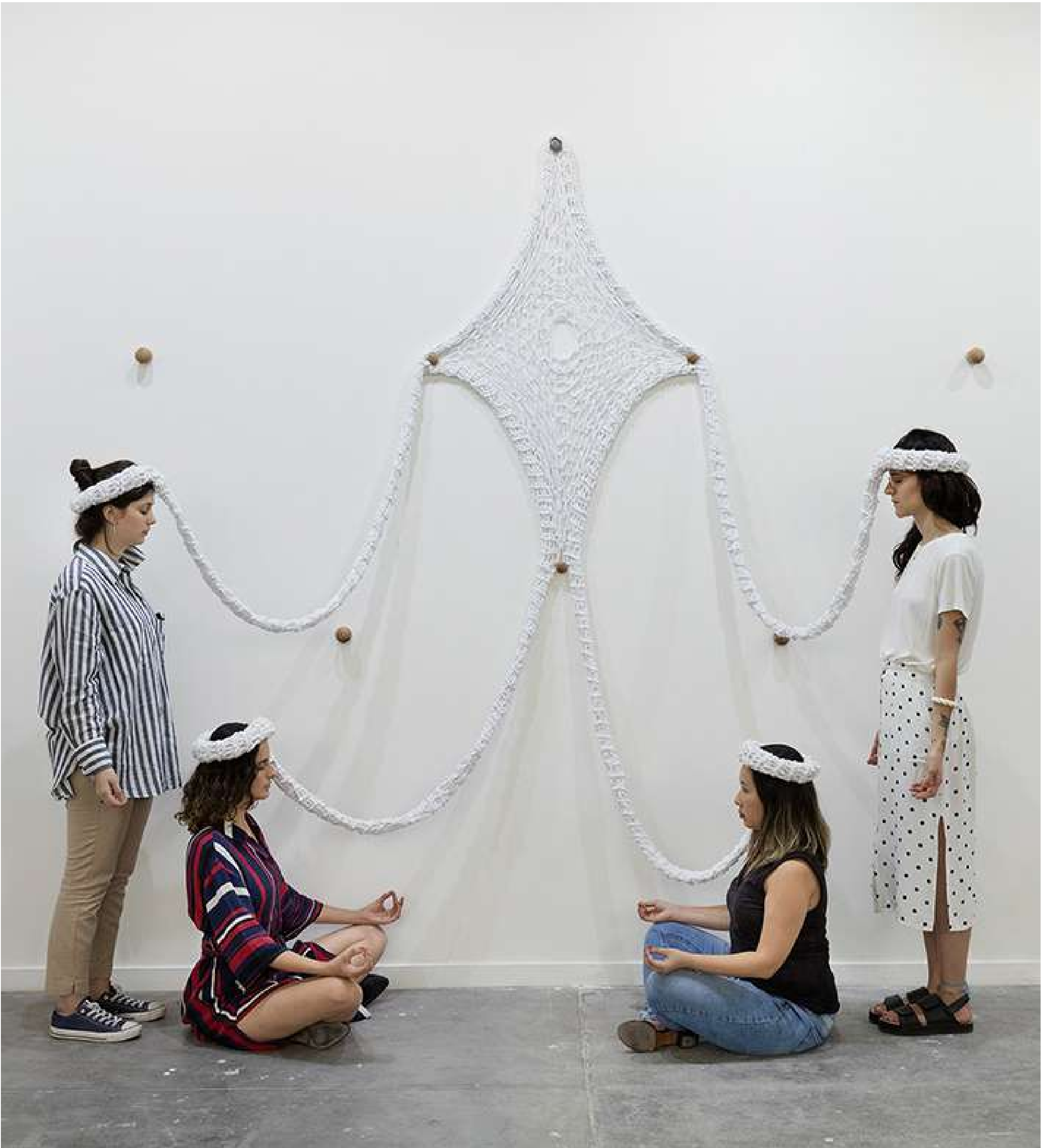
Ernesto Neto, Oxalá , 2018