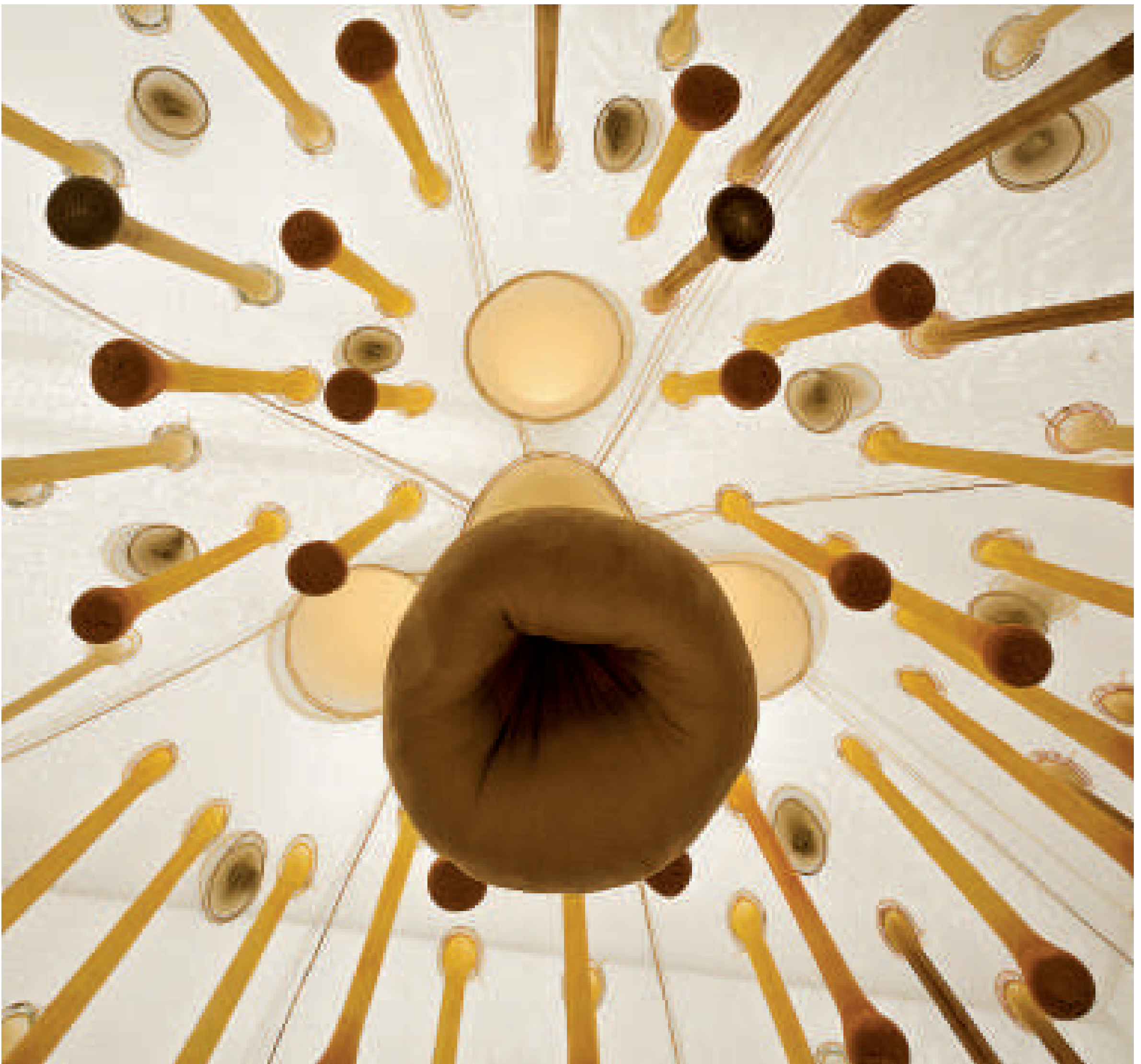
Ernesto Neto, Enquanto nada acontece , 2008/2019