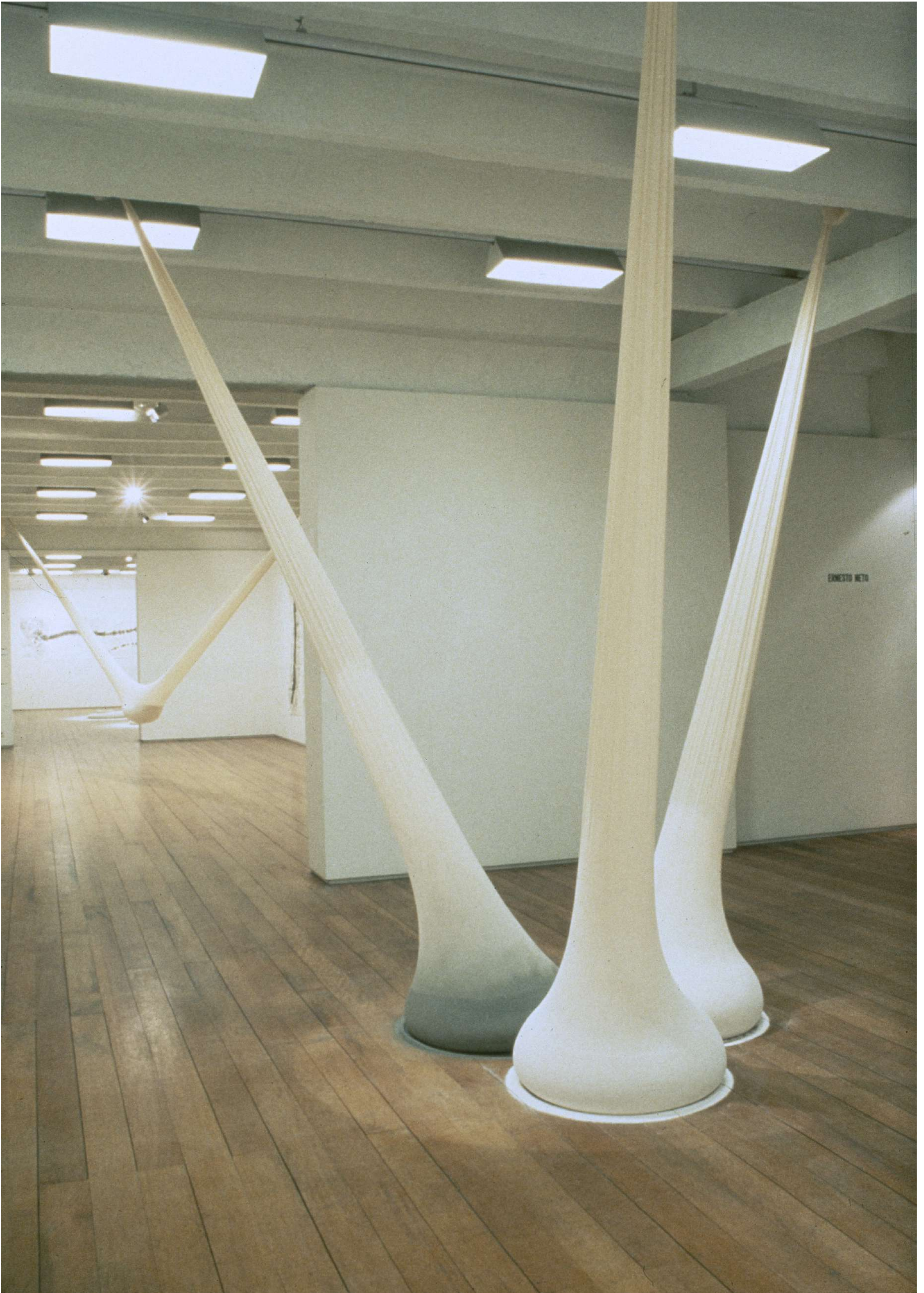
Ernesto Neto, Venus Quark Paff , 1997