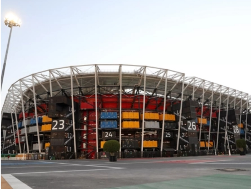
Carbon Neutral FIFA World Cup™

The World Cup organisers have heavily promoted the upcoming 2022 FIFA Qatar World Cup as “fully carbon-neutral” on social networks, 5 as well as in various sustainability-related documents and posts on FIFA’s website. 6