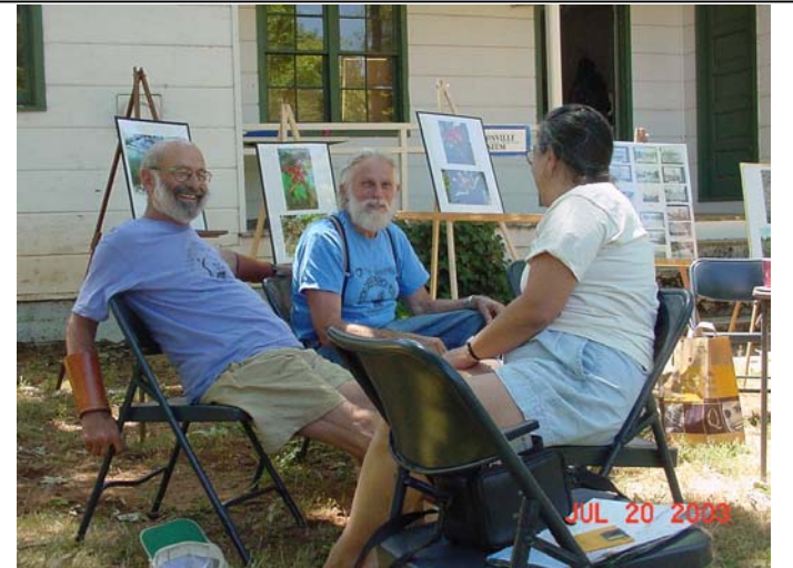
Local characters telling tall tales at the museum