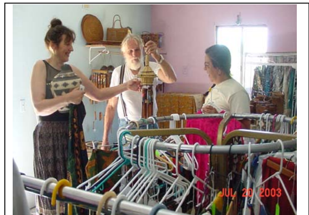
Admiring a basket at the Art Shop