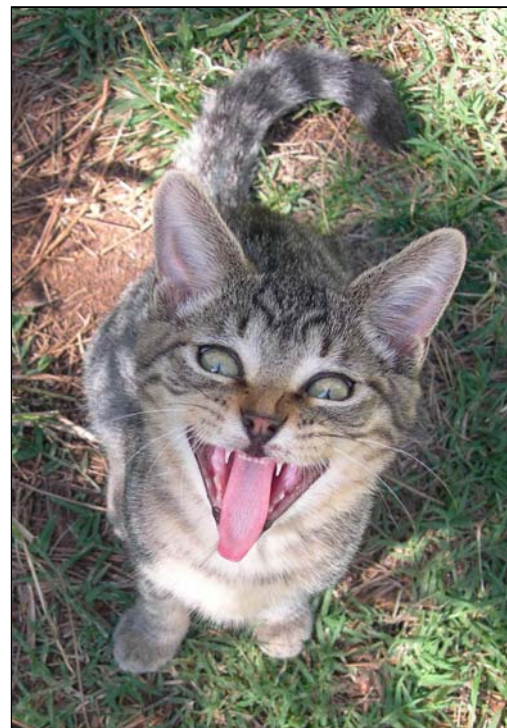
Chico Marx--Funny Guy