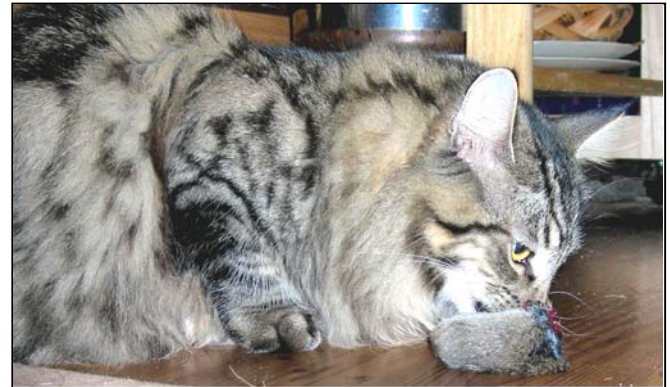
Che-not just another pretty face!

Please call me if you are interested in these lover boys...Georgeann 288-3523