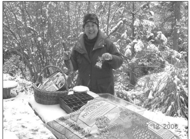
Neither rain nor snow deterred this determined seed planter.

Hopefully, your seedlings are doing well and will be ready for the plant sale in May. Anyone having plants they wish to sell is welcome. There is a $7 charge for plant selling space. Camptonville school, Kitchen's Gardens, and our regular local gardeners will have the traditional fare of vegetables, perennials, and always a few surprises. There will be more details in May's Courier.