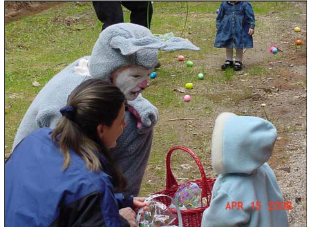
The Easter Bunny handed out candy.

It really does take a village to raise all of our children.