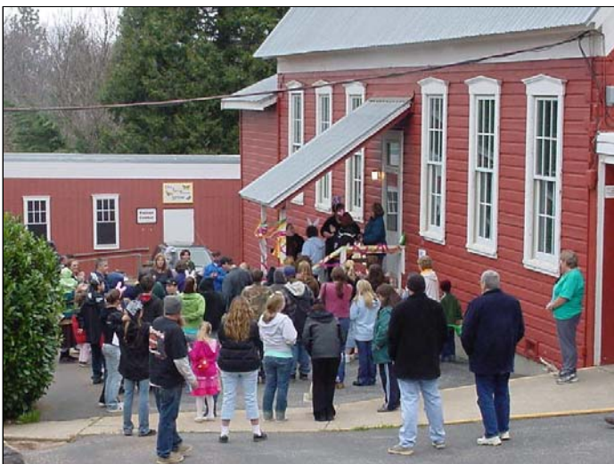
A big crowd waited for the start of the hunt.