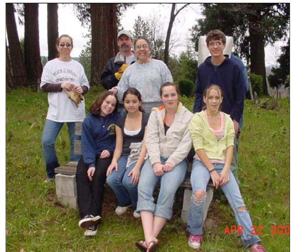
Cemetery cleanup crew

(all past Camptonville graduates) had developed in their few years in high school and how important it is to look at them as guides for our younger students. All of our children will have difficult choices to make somewhere in their lives and if we don't provide them with foundations and guides, they may easily get lost. Luckily, there is actually a fairly simple way for us as adults to do that – be there, listen, and communicate without judgment – it's amazing where that can get you with a teenager. All of our kids in the Camptonville community have something to offer and if we give them a chance it will be the whole community that reaps the benefits!