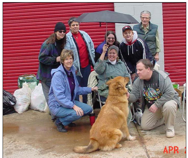
Earth Day participants.

As you may remember, a year ago, Camptonville Community Partnership (CCP) was working hard to keep the Resource Center and community programs going. Today, CCP is strong and committed to the vision that has been strengthened at recent community meetings. We will continue working for a vital present and a promising future for Camptonville – for our people, a locally-connected economy, and healthy rural environment.