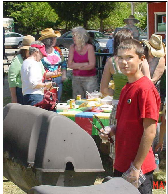
Club live served a good lunch

Harmony Health Medical Clinic and Family Resource Center