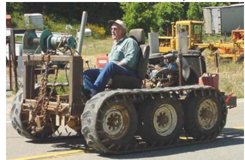
and other conveyances.