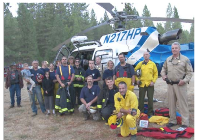
Camptonville, Pike and Alleghany Fire Departments, completed a CHP helicopter training Saturday