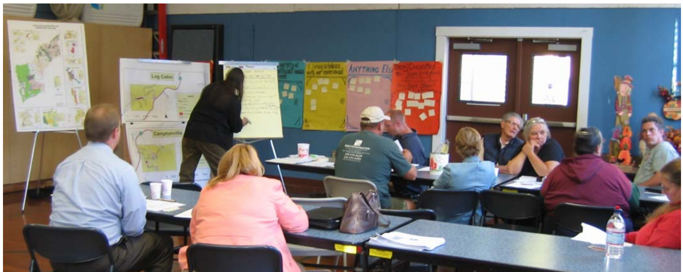
CHAT and Yuba County Planning Department meeting September 19