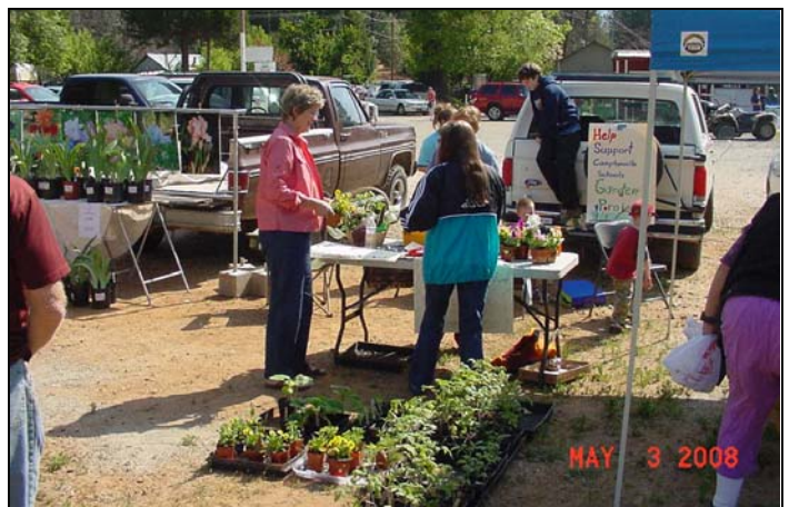
School Garden booth at the Plant Sale