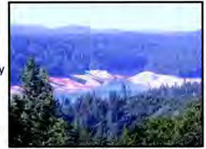
Bullards Bar on 7.14.15

The weather has surely warmed up. Please be extremely careful. The Cottage Creek boat ramp at Bullards Bar Reservoir is closed due to low water.