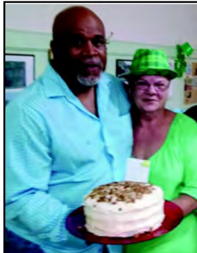
Grand Winner & Baker 2015 Dessert Auction

Bake up a mouthwatering contribution to the annual St. Patrick's Day Dessert and Pie Auction, and start a bidding war. You'll not only be giving Camptonville its "just desserts" you'll also be helping to fund our future. Call Yakshi to be put onto the dessert-making list (288-0619).