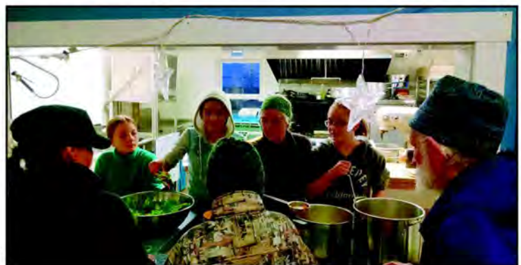
A scrumptious free dinner for all