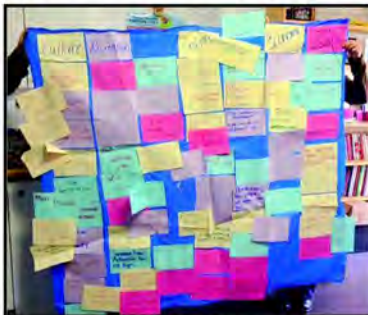
Group's ideas on the sticky wall