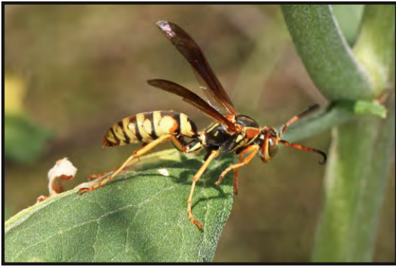
Golden Paper Wasp