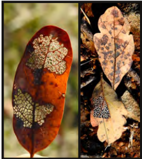
Blue Oak leaves

For a change I thought I'd feature an area very near Camptonville that is a great place to hike in the winter and spring. It's called the Daugherty Hill Wildlife Area and is managed by the California Department of Fish and Wildlife (CDFW). There are four units to explore. Two of the units are just past Collins Lake; the other two are