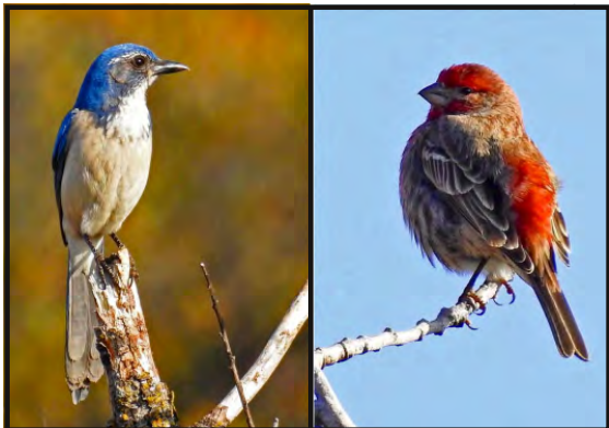
Scrub Jay and House Finch

Blue Oaks are found only in California. They are named for the bluish-green cast of their deciduous leaves, which are currently a lovely, rich brownish-yellow. They are the most drought tolerant oak of California's deciduous oaks and have deep, extensive root systems. They usually grow on dry hilly terrain between 3,000 and 4,000 feet or lower, where a water table is unavailable. They can live to be 400 years old! They live where the winters are mild and wet and the summers are hot and dry. The trees are monoecious (both sexes on the same tree) and are wind pollinated. The acorns are eaten by a wide variety of wildlife, including squirrels, birds, bears, and deer.