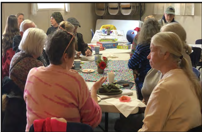
Conversations at the Coffee