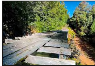
Hell for Stout Flume, Forbestown Ditch

Yuba Water Agency's Board of Directors today committed $200,000 to help the North Yuba Water District upgrade a deteriorating wooden flume that delivers water for residential and agricultural use in the Yuba County foothills. The funds will cover the construction of a new, inverted siphon to replace the aging Hell for Stout Flume, which is part of the Forbestown Ditch, and increase its capacity for water delivery.