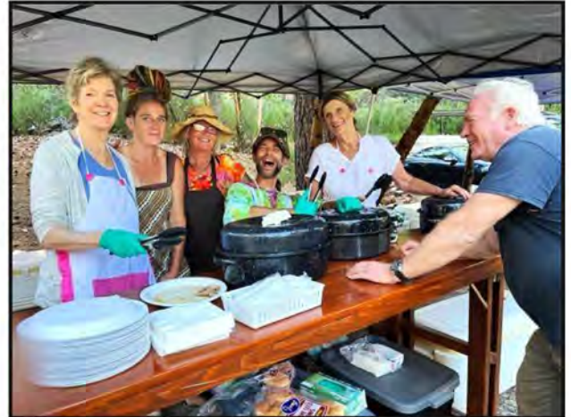
Volunteers serving up the yummy barbeque