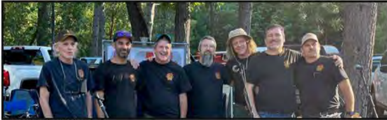
CVFD Crew (partial roster)

See article by the CVFD Auxilliary and additional pictures on page 5.