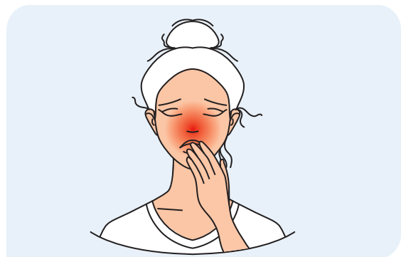
Congestión Nasal Nasal Congestion