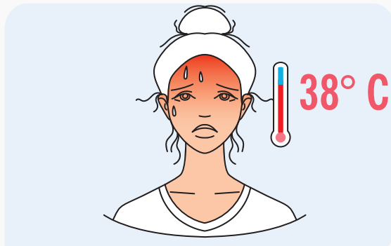
Fiebre / Fever