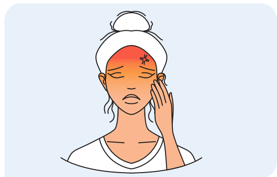
Dolor de cabeza Headache