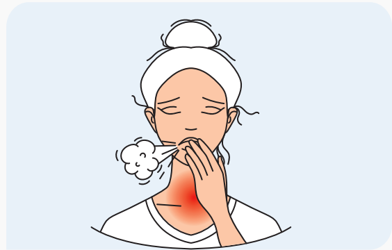
Tos Seca / Dry cough