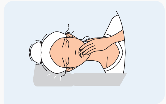
Cansancio / Fatigue