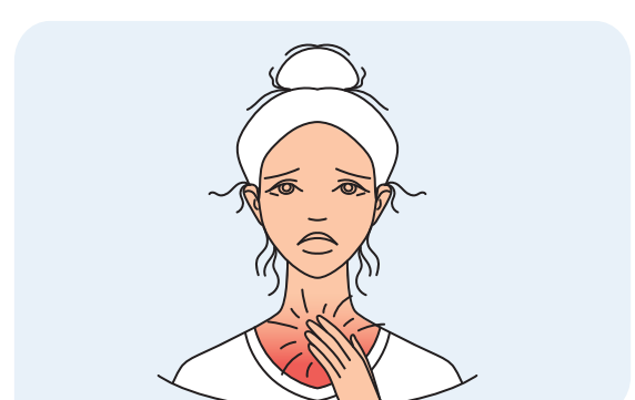
Dolor de Garganta Sore throat