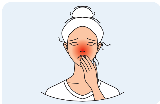
Secreción Nasal Runny Nose