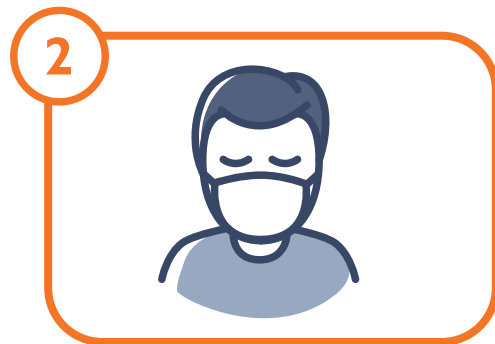
2 SPECIFIC TRAINING ADAPTED TO STAFF IN RELATION TO COVID-19.