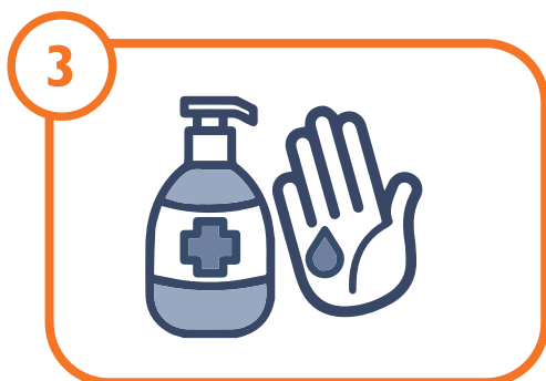
3 VERIFICATION OF DISINFECTION PROCESSES. MICROBIOLOGICAL TESTING.