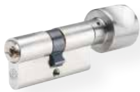
Profile knob cylinder no. 815 RHM brass, satin nickel-plated Locking function on one side, aluminum knob on the other side, NF, various knob shapes available (figure shows shape H)