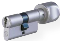
Knob cylinder no. 815 PSM Brass, satin nickel plated One side locking Other side aluminium knob, F1, various knob shapes available (figure shows shape H)