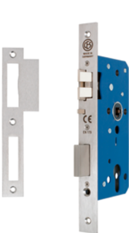
Article number 0522