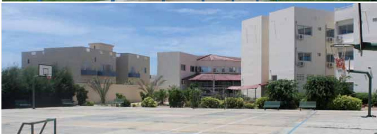
Top: The new AfricaRice Regional Training Center, Boudiouck, Saint-Louis, Senegal. Bottom: Dedicated recreation area for trainees' and trainers' use at the new Regional Training Center