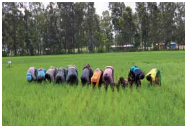
Like many other labor-intensive farm activities, weeding puts a lot of strain on the body, especially the back

"The study aimed at generating knowledge on why modern technologies were not adopted by East Africa's women rice farmers," says AfricaRice rice value-chain