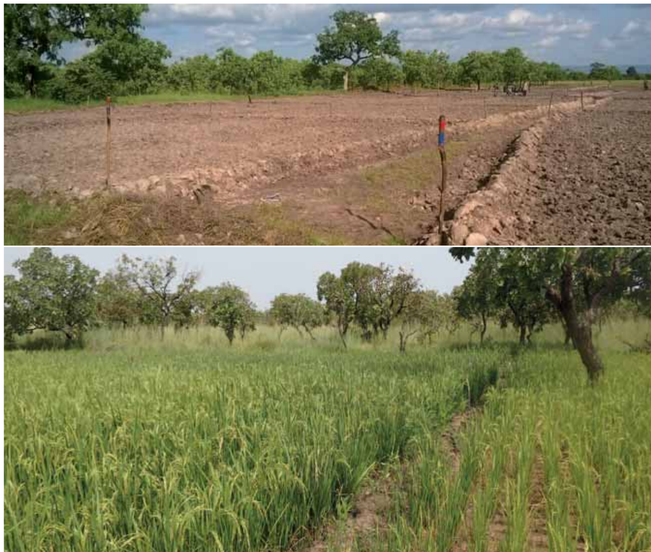
Top: Construction of Smart-valley main canal, Materi, Benin. Bottom: Growing rice crop, Smart-valley, Materi, Benin

Contact: Elliott Dossou-Yovo <E.Dossou-Yovo@cgiar.org>