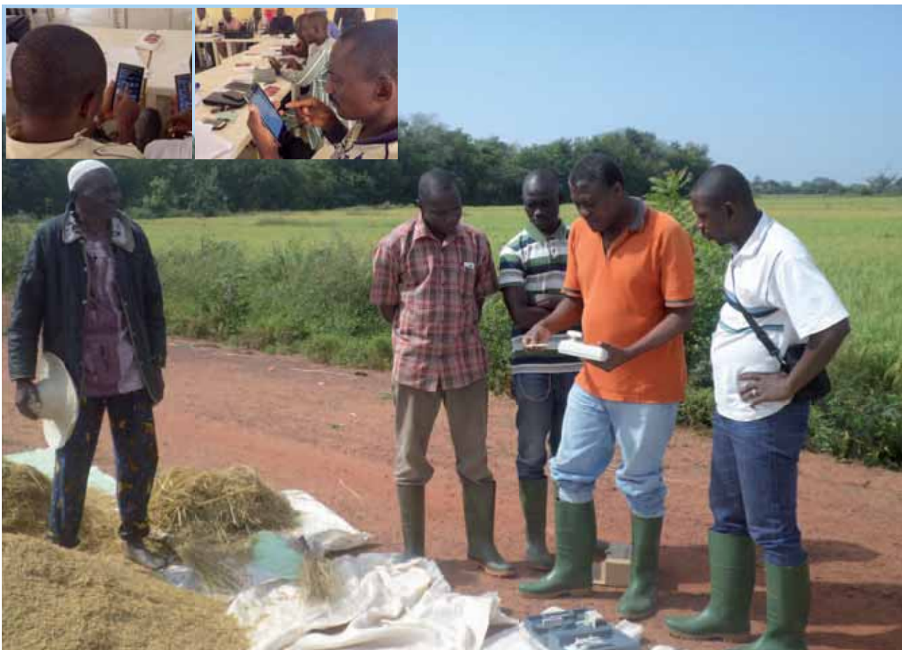
RiceAdvice training, Burkina Faso, and Nigeria (inset)