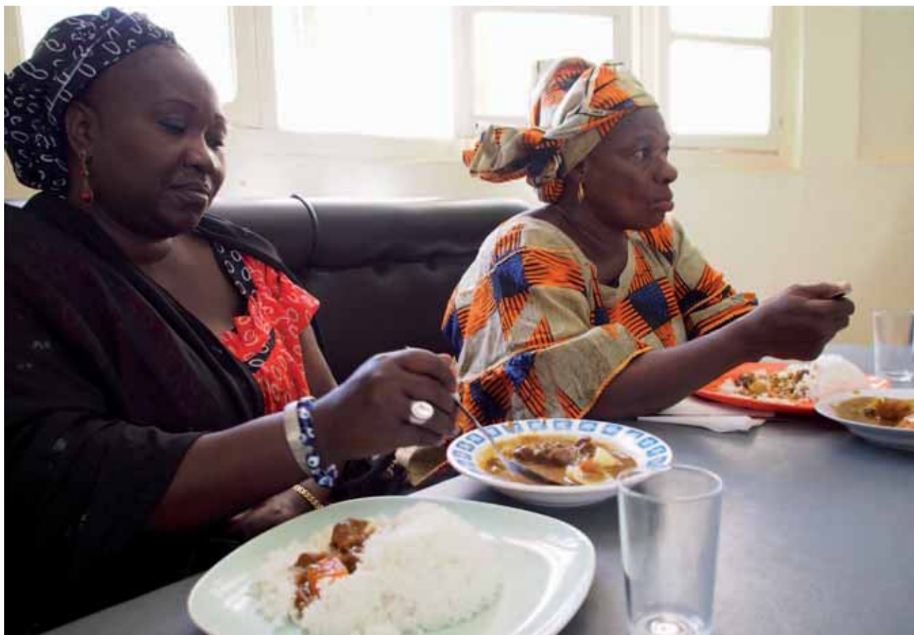
Rice is fast becoming the preferred food in many sub-Saharan African countries

Contact: Rose Fiamohe < E.Fiamohe@cgiar.org >