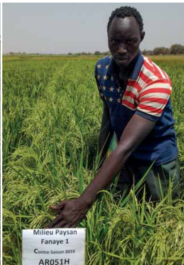
AR032H and AR051H, the two hybrid rice cultivars set for official release in Senegal in 2017, as grown in the 'off-season' in farmers' fields in 2016