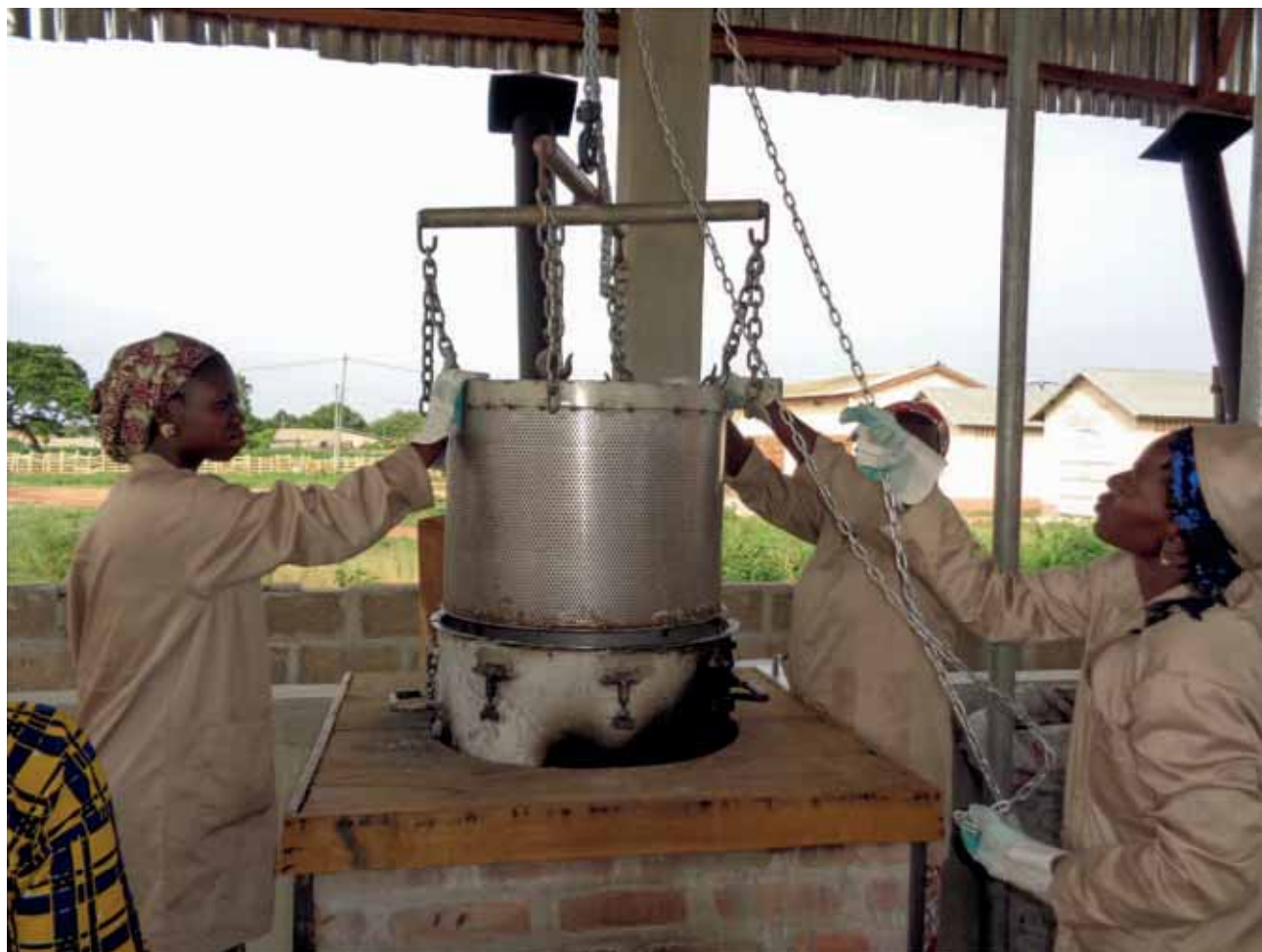
The pulley–hoist and efficient stove help make the GEM setup safer for operators