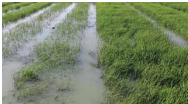
Screening for salt tolerance at vegetative stage: Tolerant lines (right) compared with susceptible lines (left)