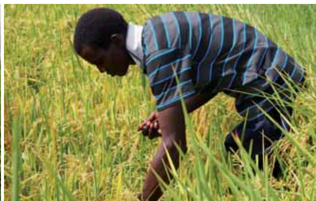
AfricaRice believes that hybrid rice technology can help leverage private-sector investment in rice R&D in Africa