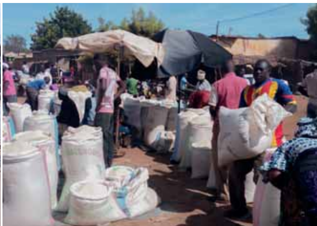
There is often stark contrast between the ways in which imported rice brands (left) and local rice (right) are marketed: bright bags with memorable logos versus generic white sacks with basic printing