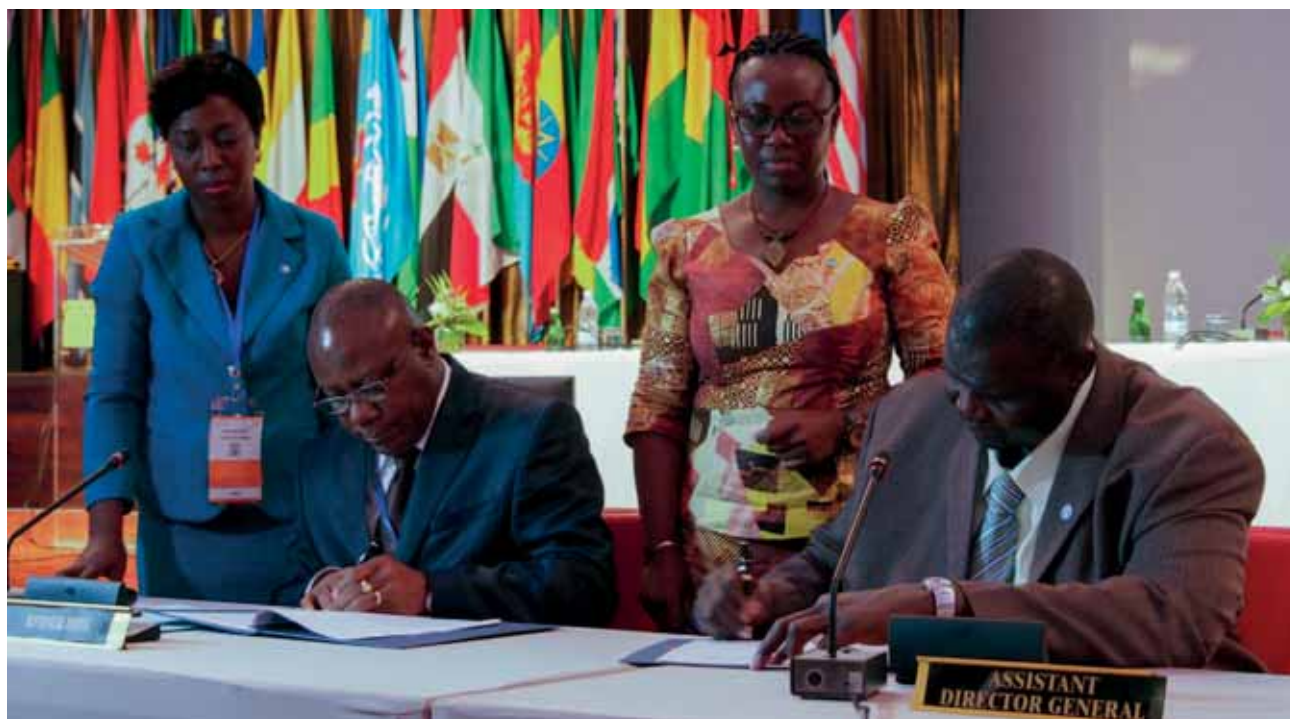
FAO and AfricaRice sign an MoU for scientific and technical cooperation in consolidating sustainable rice systems development in Africa during the 29th session of the FAO Regional Conference for Africa, Abidjan, Côte d'Ivoire, 8 April 2016