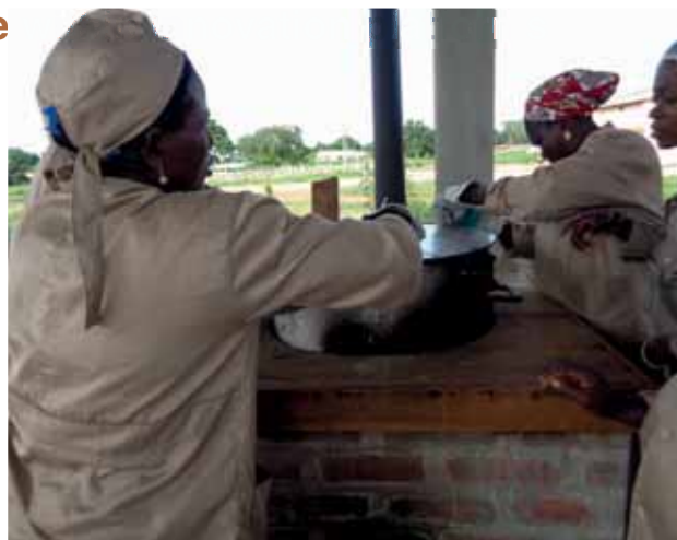
Women parboilers operating the improved steamer in the improved stove