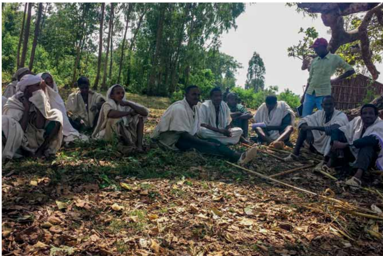
Focus group discussion, Ethiopia