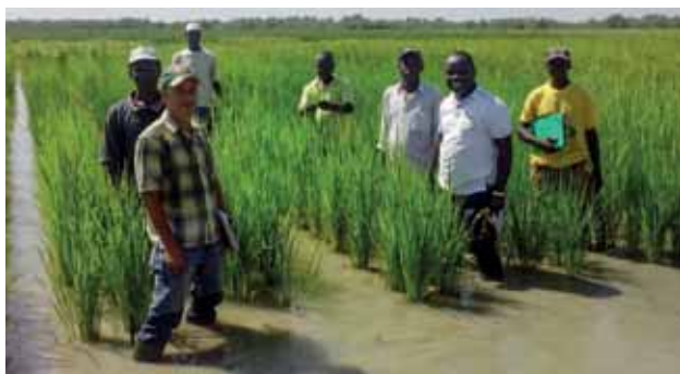
Field visit to a mangrove field in Guinea where the newly developed Saltol lines are grown